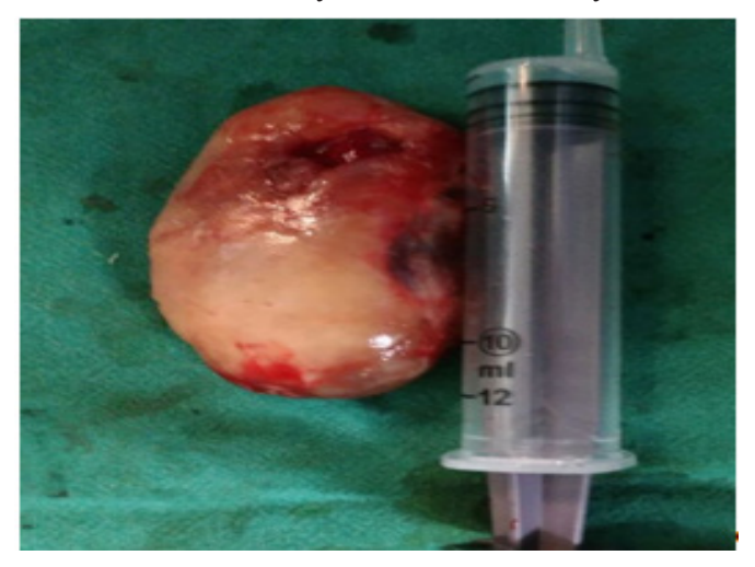
Fig. 3.Surgical specimen of the parapharyngeal mass

A transcervical excision of the tumourwas performed to remove the tumour in toto from the right parapharyngeal space (Fig. 3). Jugulo-digastric lymph node was sampled. Histological diagnosis of the tumour mass showed normal thyroid follicles lined by cuboidal