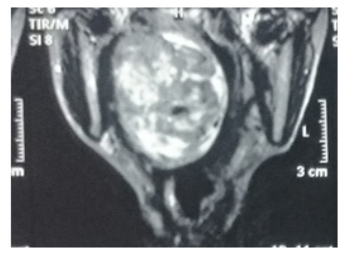
Fig 2. MRI showing right parapharyngeal mass

epithelium and filled with colloid. There was no evidence of malignancy. The enlarged lymph nodesshowed reactive lymphadenitis. Postoperativethyroid function, after one week of surgery was within normal limits.