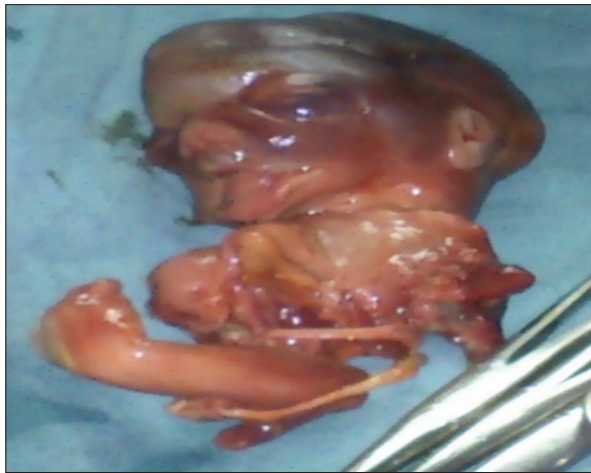
Figure 2: A 4 months abortus

spontaneous uterine rupture, so thought should be given on medical termination in women with previous cesarean