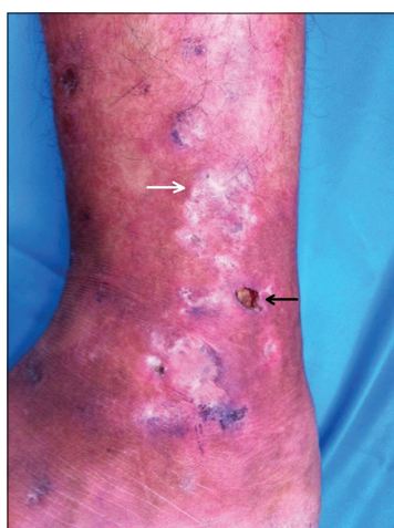
Figure 2: Livedoid vasculopathy. Note the erythema, edema, ulcer (black arrow) and the characteristic ivory-white stellate scars (white arrow)