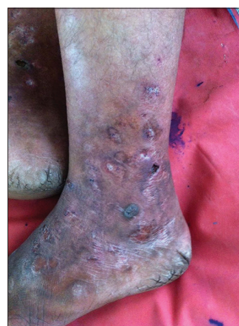
Figure 3: Same patient [Figure 2] after 1 week of treatment with subcutaneous enoxaparin 75 mg twice daily. Note the reduction in erythema and edema, and the beginning of resolution

vasculopathy. Hairston et al. used enoxaparin in a dose of 1 mg/kg twice daily (the dose used to treat active thrombosis) for 6 months followed by 1 mg/kg/day in one patient and 30 mg/day twice daily (peri-operative thrombo-prophylactic dose) in the other for 7 months. Di Giacomo et al. used enoxaparin 40 mg daily, dalteparin 5000 IU/day and unfractionated heparin 5000 IU 12 th hourly in 5, 3 and 3 patients respectively. [5] Yang et al. treated 27 patients of atrophie blanche using unfractionated heparin. Nineteen (70%) of these patients who were administered a dose of 5000 IU daily had significant pain relief. [14] Hesse and Kutzner employed sub-thrombo-prophylactic doses of dalteparin (2500 IU/day for 14 days and then on alternate days until the ulcers healed) in 16 patients, nadroparin (2850 IU, 0.3 ml) in four patients and enoxaparin in two patients for an average duration of 7 weeks. Nineteen (86%) of these 22 patients showed complete remission. [7]