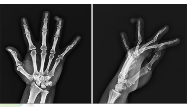
Figure 2: A plain X-ray (anterolateral and lateral views) of the left hand showed a well-defined soft tissue shadow around the tip of the ring finger without any connection with the distal phalynx