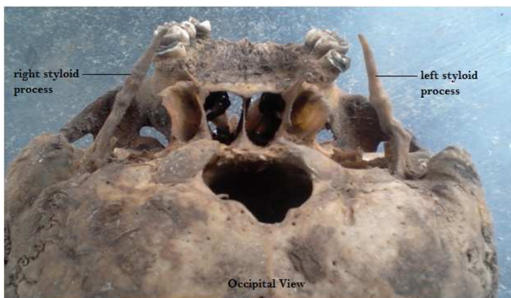
Fig 3: Occipital view showing of both right & left styloid processes.

Kouladouros et al. (2009) reported that the etiology can be explained by a genetic alteration or according to three different theories. The first theory, the hyperplastic reaction, suggests that the styloid process had been stimulated by a pharyngeal trauma leading to the ossification of the styloid ligament. The second theory, metaplastic reaction, also includes a traumatic stimulus causing multiples metaplastic alterations in the cells of the styloid ligament, which results in its total or partial ossification. The third theory, anatomic variation, suggests that the styloid process and the styloid ligament are not usually ossified, but rather, an anatomic variation.