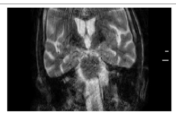
Figure 3. T2WI coronal shows globus pallidus hypointensity with central hyperintensity