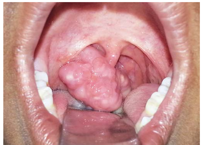
Fig. 1: Polypoidal right tonsil

Histopathology report shows, on gross morphology, a single irregular polyp like gray white areas measuring 5 \times 2 \times 1 cm. Cut section shows gray to pale white tissue. Microscopy shows tonsil covered by stratified squamous epithelium with papillary pattern and florid lymphoid