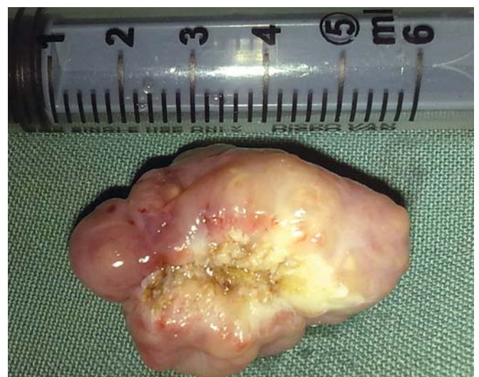
Fig. 2: Surgically excised specimen