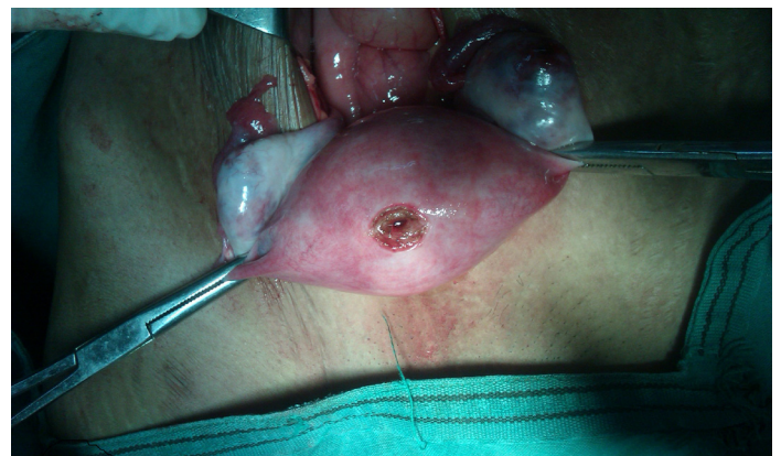
[Table/Fig-2]: Per Operative