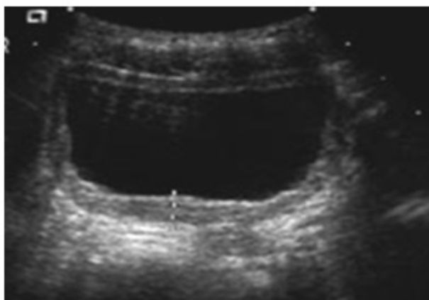
Figure 1. Ultrasound image of bladder with wall thickness measured between the two white lines

We studied 200 patients, 111 males and 89 females with a mean age of 35.16 ± 12.37 years (18-70). Age wise mean bladder wall thickness is summarized in Graph 1. The mean bladder volume was 349.21 ± 85.8 ml. The mean bladder wall thickness in our study population was 3.08mm (2.32 - 3.84mm). The BWT in males was 3.12mm (2.36 - 3.88mm) and in females was 3.03mm (2.26 - 3.8mm). Although the bladder wall in males was thicker than in females, the difference was not statistically significant (P= 0.105).