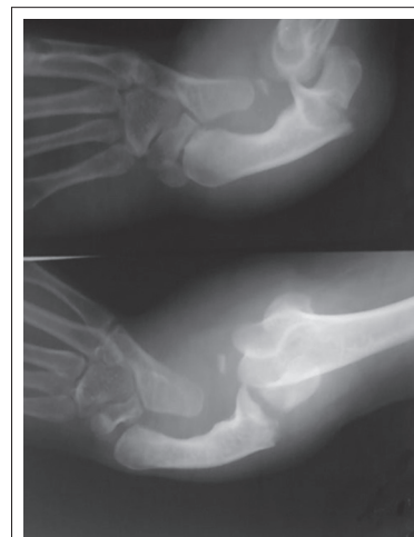
Figure 1: Radiograph at the time of presentation.

Surgical therapy is performed around the age of one year in these children. Centralization remains the principal procedure to realign the carpus onto the distal ulna and is indicated in Types 2, 3, and 4 radial deficiencies.