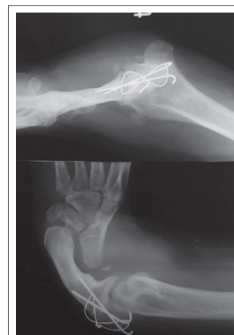
Figure 2: Post-operative radiograph.