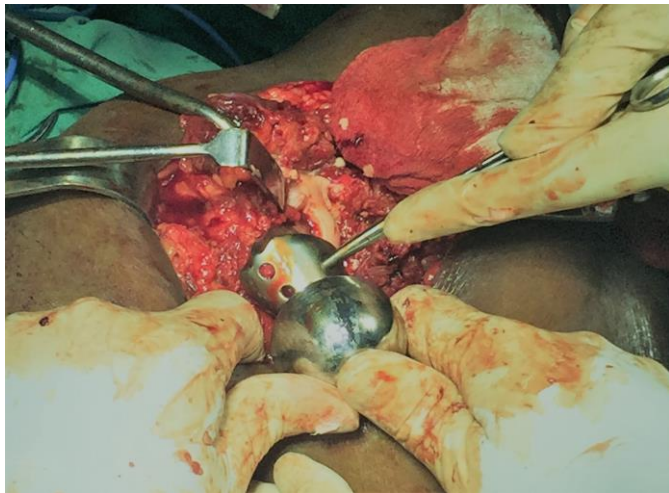
Fig 2: Intraop picture of Bipolar Prosthesis

Bipolar Hemiarthroplasty having less complications than in unipolar implants like- loosening, dislocation, protrusion, and acetabular wear. Due to dual bearing surfaces in prosthesis good advantages such as sharing of the motion at the two surfaces and hence, it reduces the net wear at either surface, thus reducing erosion at the acetabular joint interface. In addition, the total range of motions at the joint is increased. In wide femoral canal Cemented fixation gives the implant good stability. an unstable intertrochanteric fractures, allowed early walking with full weight bearing and helped the patients to return to prefracture level of activity rapidly, preventing complications such as pressure sores, pneumonia, atelectasis and pseudoarthrosis”.