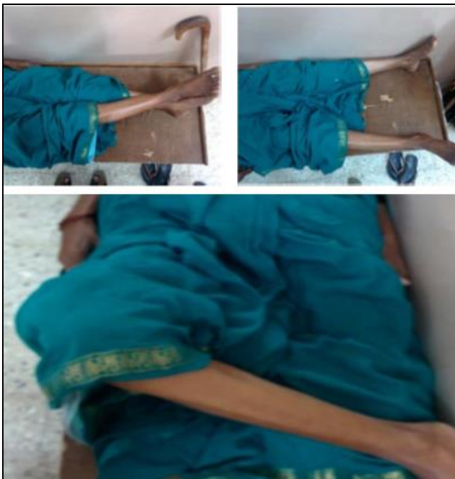
Fig 10: Movements at 6 Weeks of Follow Up