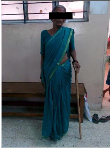
Fig 9: Follow Up At 6 Weeks