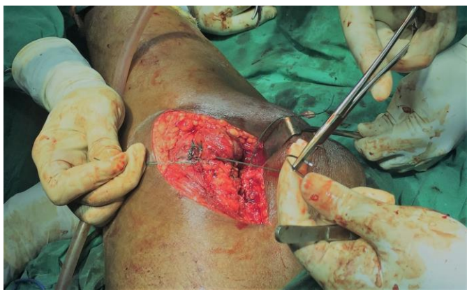
Fig 3: Greater Trochanter Reconstruction with Ethibond Sutures