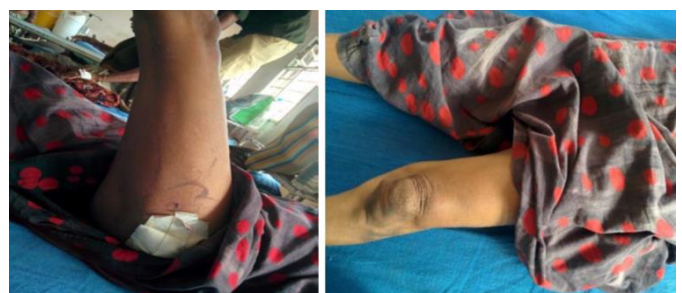
Fig 8: Flexion and Abduction on Post Op Day 3