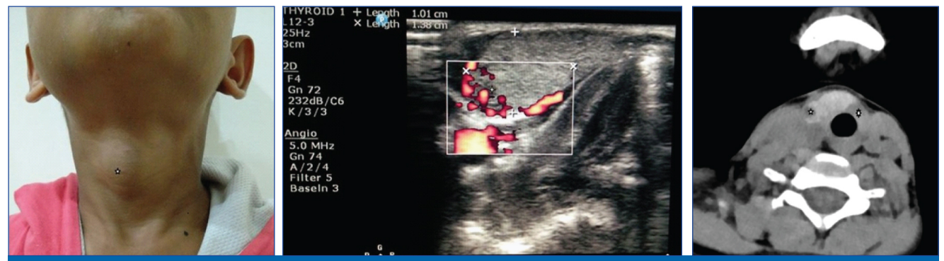
[Table/Fig-1]: Clinical image showing swelling (*) on the right side of neck. [Table/Fig-2]: USG showing Right lobe of thyroid (denoted by measurements) with a small hypoechoic nodule and visualised isthmus. [Table/Fig-3]: A well defined hypodense nodule (*) in the right lobe of thyroid. Right lobe and isthmus are visualised and not the left lobe (*).

was also seen adjacent to the right lobe, wrapped around the cricoid cartilage [Table/Fig-2]. Few tiny well circumscribed, round,wider than tall, cystic nodules were noted in the right lobe of thyroid with unremarkable vascularity. These findings were suggestive of benign thyroid nodules and were reported as American College of Radiology-Thyroid Image Reporting and Data System (ACR-TIRADS) TR1 category [1]. The left lobe was not visualised which precipitated us to further evaluate for hemiagenesis of thyroid by CT-scan. Non enhanced CT study of the neck was performed with sections taken from the base of skull to the superior mediastinum, 27x9.4x29 mm sized hyperdense thyroid tissue including only the right lobe and isthmus were seen with a few tiny hypodense nodules of which the largest nodule measured 4.6x5.1x7 mm. No ectopic thyroid tissue was seen in these sections [Table/Fig-3].