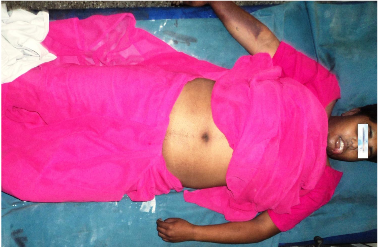
Fig 2: Deceased in a transvestite attire with blood tinged froth from the mouth (plastic bag was removed from the face before the police arrived)