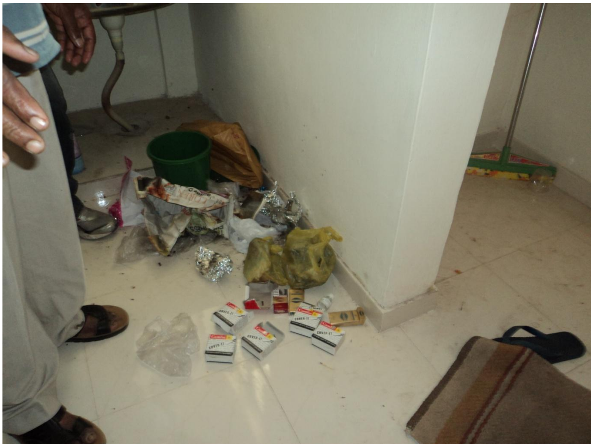
Fig 1: Multiple bottles of Camlin whitener eraser along with empty bottles of alcohol and smoked bits of cigarette seen at scene of occurrence.