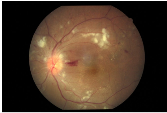
Fig-2: Hypertensive retinopathy

There are very few studies on the causes and clinical features of bilateral optic disc swelling in India and they had a very small sample size.