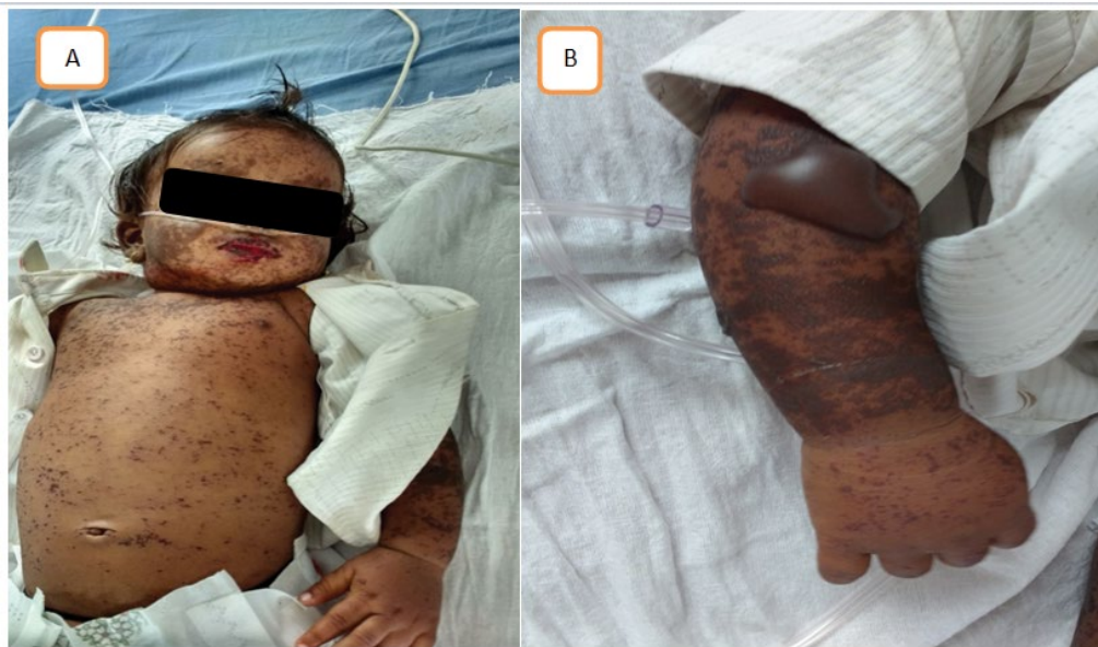
Figure 2 A: Showing multiple erythematous patches on the cheeks; B: Showing erythematous patches on the right forearm with blisters