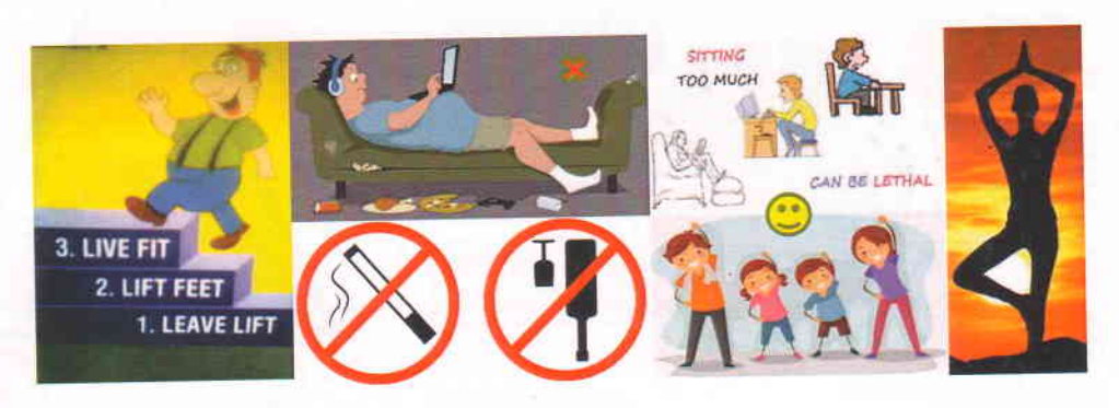
Figure -3 For good health, the following do's and don'ts are recommended

when developing disease. The second is there is a delay in onset of disease, third is the disease occurs in lesser intensity which leads to lesser morbidity and mortality, the fourth is they live long and fit during old age and fifth is their immunity status is better than those who do not practice.