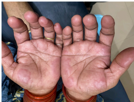
Figure 1 Erythematous plaques over both palms with few lesions over digits showing oedema (pseudovesicles).

Usually the dorsa of the hands are frequently affected, the palmar involvement in the index case appears to be unusual. There are very few reports of palmoplantar involvement. 2-4 Rare presentation and dramatic response to benign treatment with dapsone is the reason to report this index case.