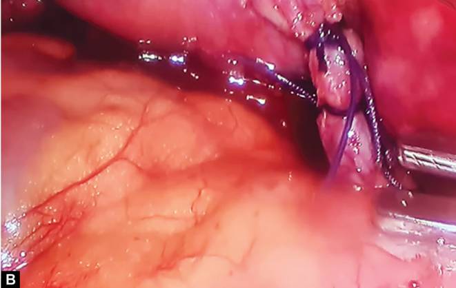
Figs 1A and B: Extracorporeal knotting of cystic duct