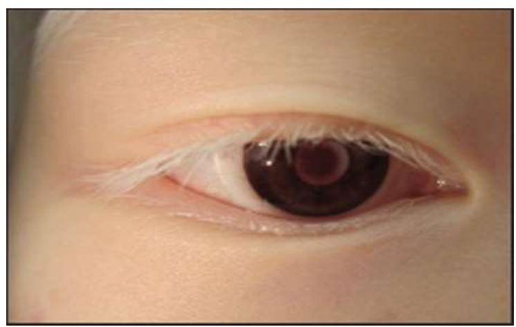
Fig-1: Depigmented eyelashes and eyebrows with hypopigmented iris