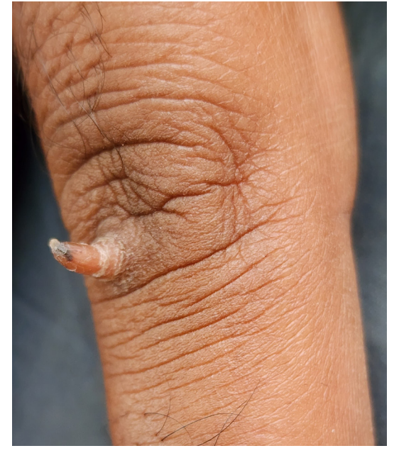
Figure 1 Horn-like growth arising from the dorsal surface of the left index finger with hyperkeratotic collarette at its base.

be seen on the lower lip, nose, elbow, prepatellar area and periungual tissue. The size of the lesion is generally less than 1 cm, but there are reported cases of ADFK of more than 1 cm. These lesions are designated as GADFKs as in the index.<sup>2</sup>