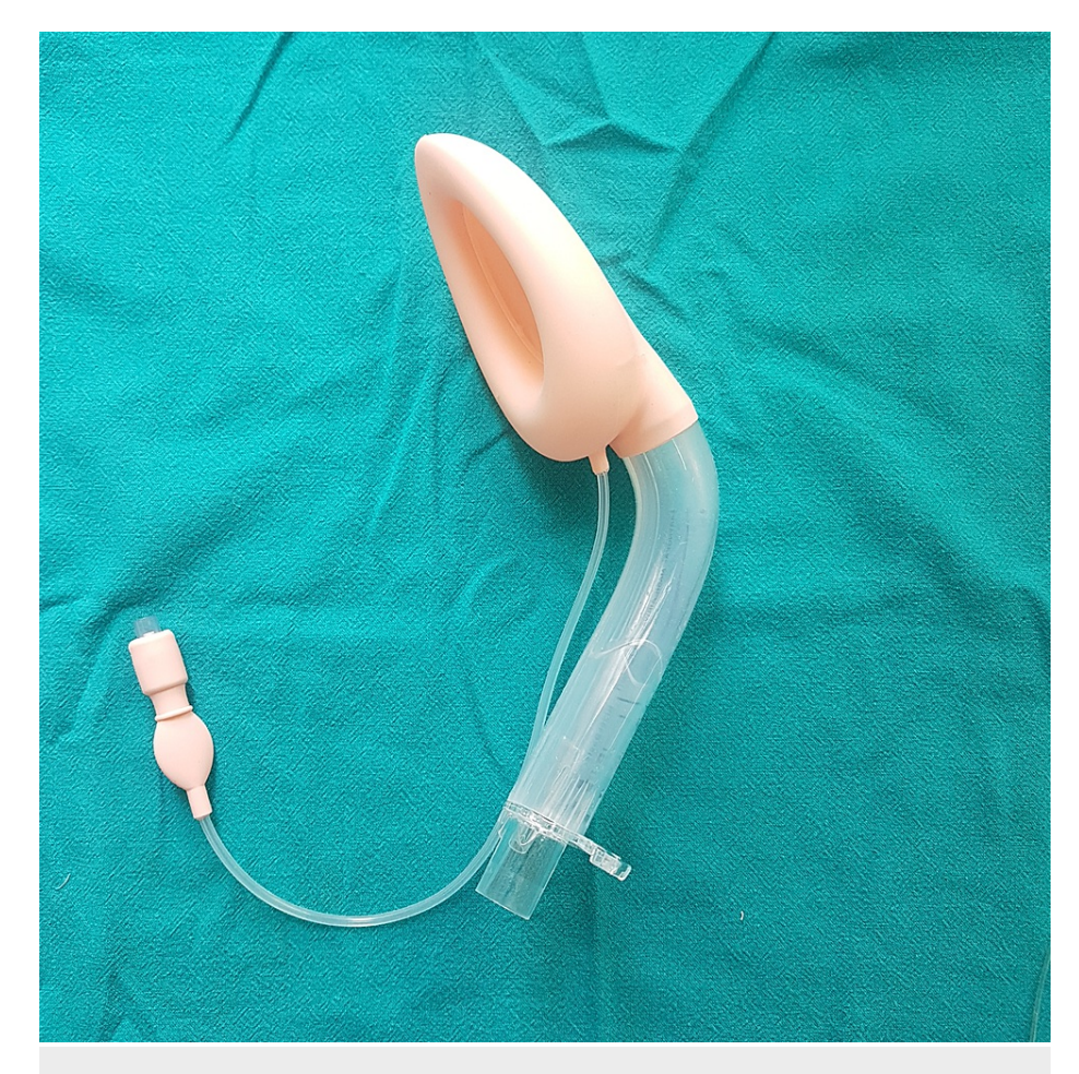
FIGURE 1: BB-ILMA BB-ILMA - Blockbuster intubating laryngeal mask airway

intubated using an F-ILMA (Figure 2). To promote Fastrach passage, the patient's mouth was opened, and the tongue was displaced with a disposable sterilized wooden tongue depressor. Pre-lubricated F-ILMA was inserted with mild inward and downward pressure, utilizing the device's curvature as a guide, until a set resistance to further progress was sensed, and the cuff was inflated and checked for respiration after connecting the F-ILMA to the breathing circuit. The presence of chest movements and EtCO2 waveforms provided evidence of adequate ventilation.