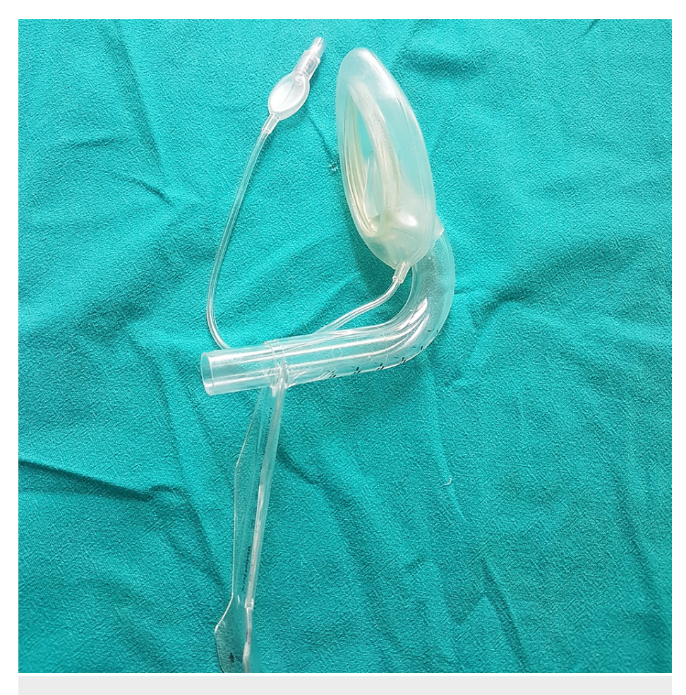
FIGURE 2: F-ILMA

F-ILMA - Fastrach intubating laryngeal mask airway