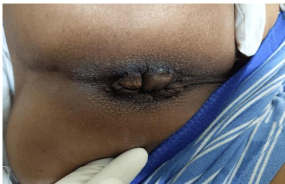
Figure 4: A 34year old gravida 4 para 3 living 2 dead 1 Female with 10weeks of pregnancy with BMI of 25 kg/m 2 with Chronic Hemorrhoids

died soon after birth due to environmental hazards. Upon physical examination, no other complication was observed in any of her systematic regions neither she has any traumatic history. DRE revealed that she had chronic hemorrhoids that has continuously been a trouble for her during pregnancy or even in the normal circumstances [Figure 6]. She has been taking the laxatives throughout the period but didn't get enough progress through it. She has been advised to apply the hemorrhoids ointment twice daily in order to reduce the inflammation and pain. Further, she was also advised to sit in a warm water bath tub to reduce the soreness. Sclerotherapy has been considered as an effective procedure in her case but with precautionary measures. [6] In her follow up sessions, she reported that she has recovered mildly from her hemorrhoids but still she feels pinching pain during defecation due to its chronicity. She delivered a healthy baby through C-section.