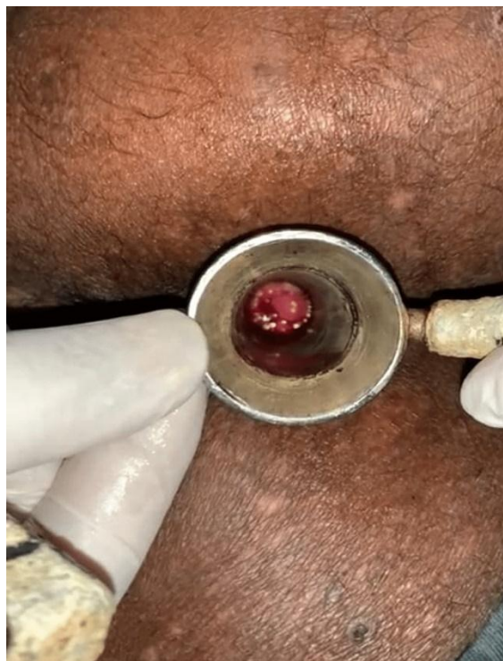
Figure 1: A 25 yr old 10 week Pregnant Female with BMI 30kg/m 2 with Grade 1 hemorrhoids

constipation from the last week. She has been visiting the hospital for her regular check-ups as this is her first pregnancy. Although, she stated that she has a family history of diabetes and constipation. She also reported that she often suffers from constipation despite taking routinely laxatives due to her sedentary life style and decrease consumption of water. Sometimes she also complains of bloody stools and pinching pain after passing stools. Upon history taking and physical examination, it has been revealed that she is obese with a BMI of 30 kg / m 2 . DRE showed that she has been suffering from grade I internal hemorrhoids and anal fissures with a swollen area surrounding all over the anus [Figure2]. Although no severe ulcerations and edema has been observed in the anal region. She has been prescribed to apply Anal pram and Tucks hydrocortisone ointment twice daily for disinfecting the overall area, decreasing the itching, swelling, inflammation and to promote the healing of the damaged tissue [4]. Her symptoms have been recovered after a continuous application for 2 weeks. She delivered her baby through C-section in this hospital.